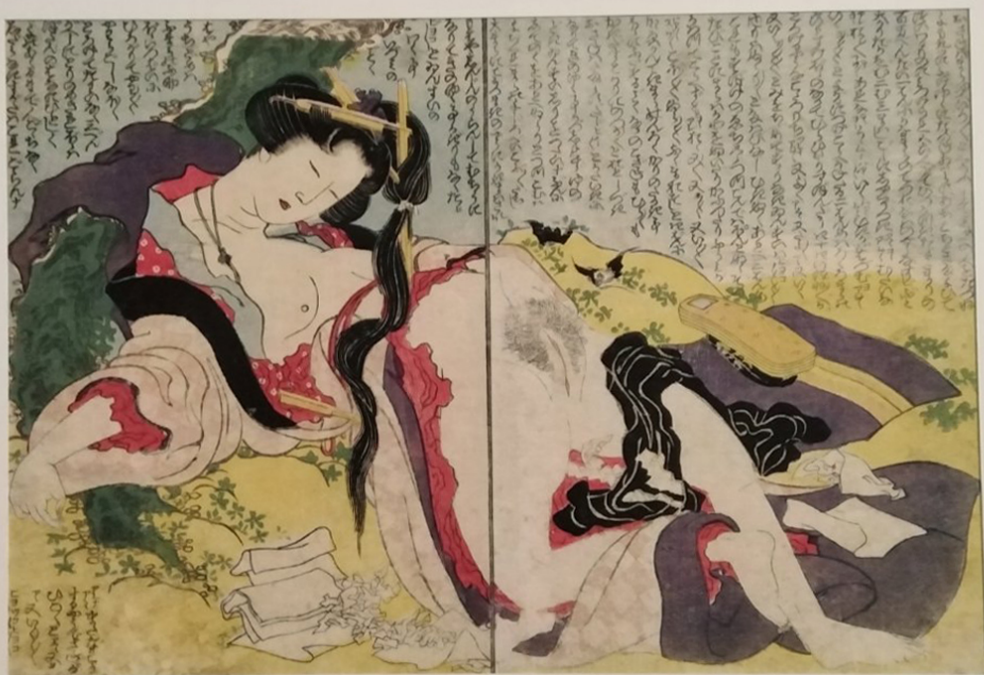
NOKUSAI KATSUSHIKA 1760-1849