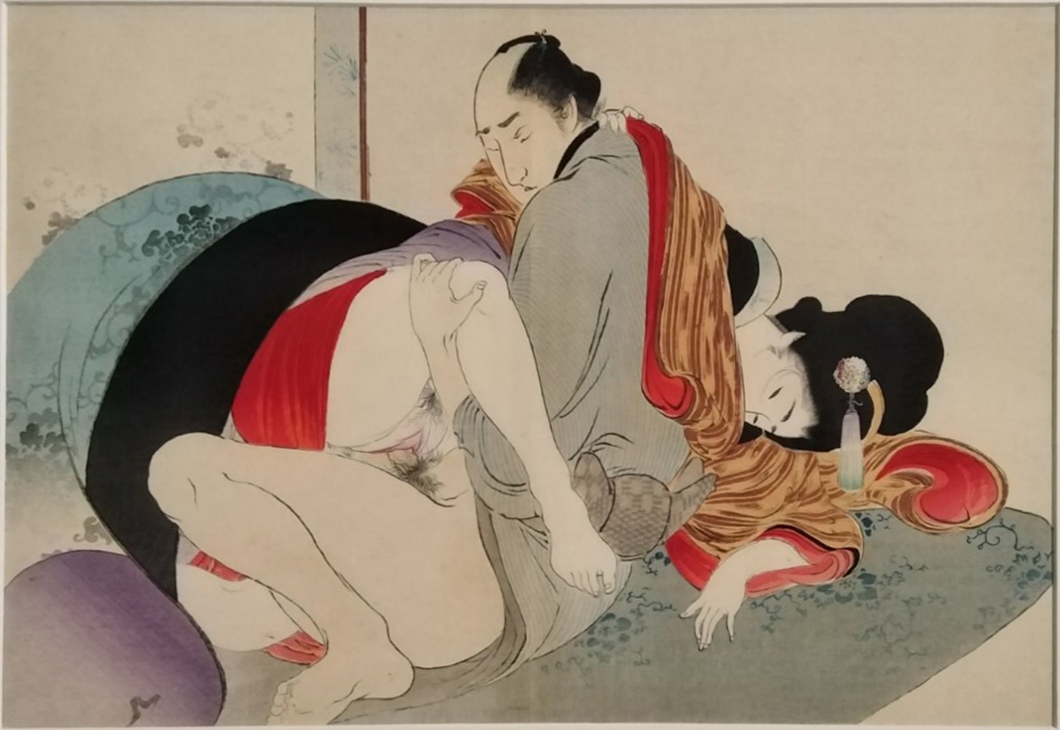
TOMIOKA EISEN 1864-1904