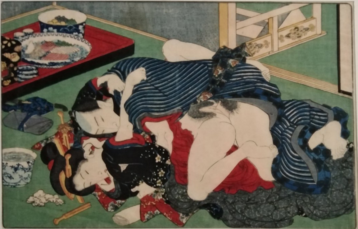
UTAGAWA KUNIYOSHI 1797-1861