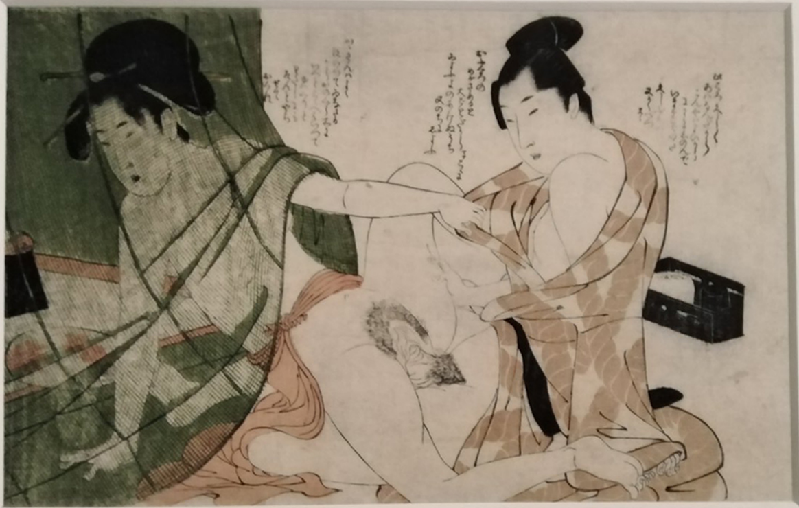
KITAGAWA UTAMARO 1753 - 1806