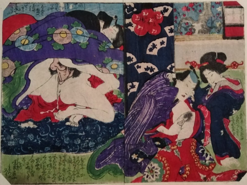
KUNISADA III 1848-1920