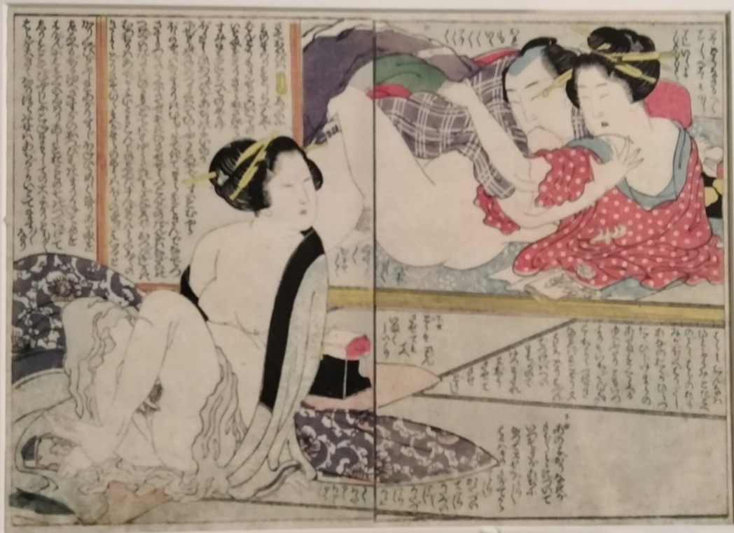
UTAGAWA KUNIYOSHI 1797-1861 67 20/27 cm 35/50 cm