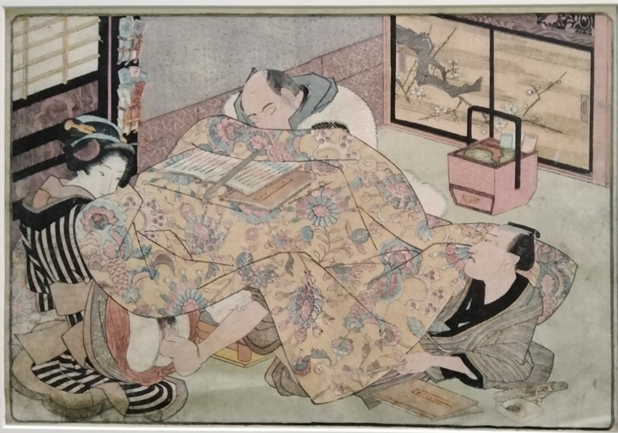
TOYOKUNI II UTAGAWA