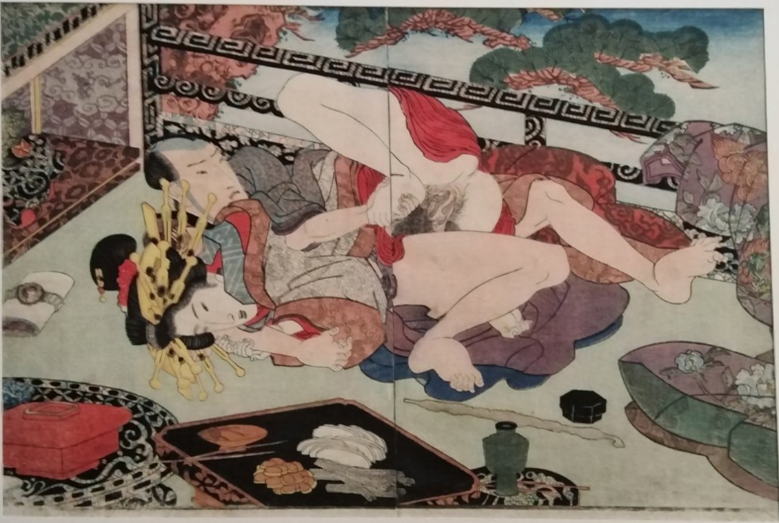
KUNISADA UTAGAWA ? 1786 - 1865