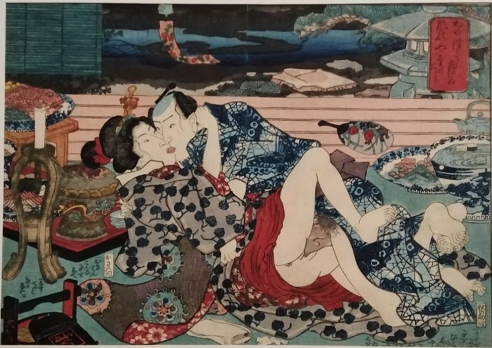
UTAGAWA KUNIYOSHI 1797-1861