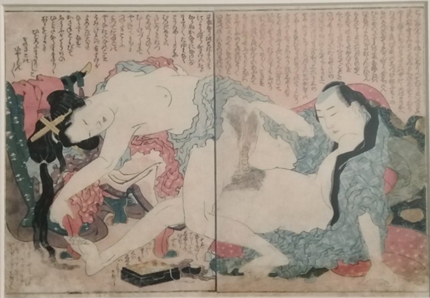
HOKUSAI 1760-1849 8 20/27 cm 42/56 cm